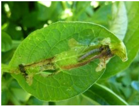
Leaf mining symptoms with the larva inside