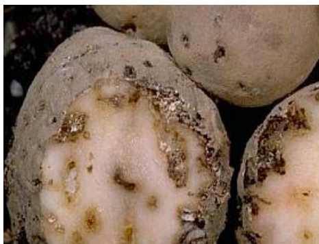
Tunnels in potato tubers