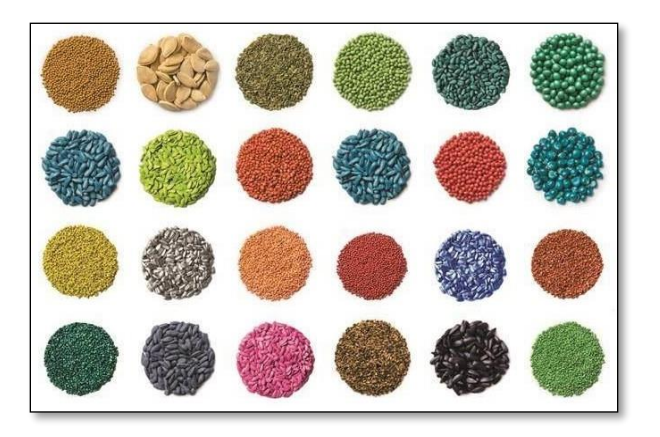
Figure 2: Seed pelleting in various Horticultural crops