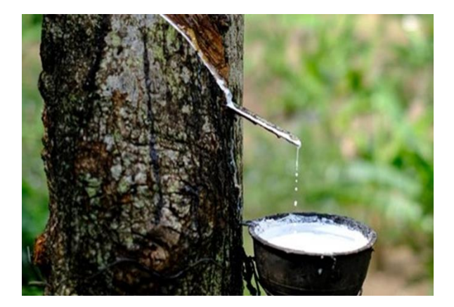
Figure 1. Rubber Tapping in Hevea brasiliensis

The process of natural rubber manufacturing begins with tapping rubber trees to extract latex, the milky fluid found in rubber plants. The latex is collected into containers and then coagulated using acid (often formic acid), forming solid rubber sheets. These sheets are then washed, dried, and packaged as raw rubber, ready for further processing. The rubber is then shipped to factories for the next steps of production.