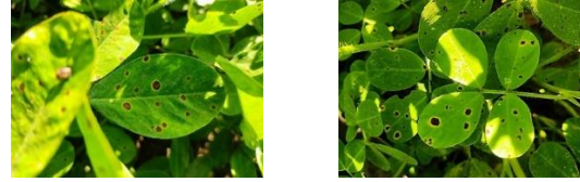
Symptom image of Groundnut Leaf spot