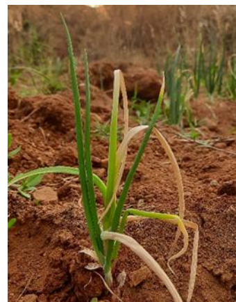
Yellowing, Curling, and dieback of Infected plant

The soil-borne saprophytic pathogen survives in the soil for a long period and infects the crop from the seedling stage up to harvest. Initially, infected plants exhibit yellowing of foliage and gradual drying of leaves, followed by wilting. The drying starts from the leaf tips and progresses downward, accompanied by rolling of leaves. Eventually, the entire plant shows complete drying of foliage. The root system collapses and decays due to the production of the toxin fusaric acid by the pathogen. Infected bulbs develop brown to semi soft watery rot along with whitish fungal mycelial growth on the basal portion of onion bulb. During storage, under favourable environmental conditions, white mouldy fungal growth appears on the basal portion of the onion bulbs, leading to decay of the internal scales (Vijayrao, 2024).