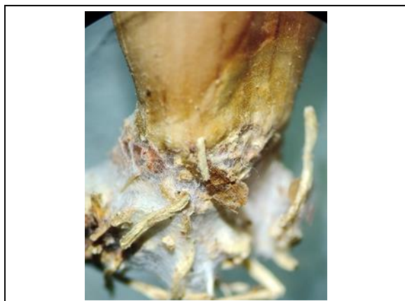
White fungal mycelial growth on basal plate