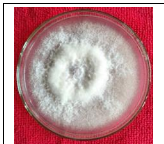
Pure culture of Pathogen

intercalarily, either singly or in chains. The macroconidia play a major role in disease spread. Chlamydo spores can survive in the soil for a long time, and when favorable conditions occur, they germinate and infect specific host plants.