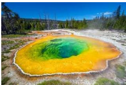
a. Hot spring of Yellow stone

They collected water and sediment samples from hot spring with a unique way like they diluted the nutrient media and incubated at 70-75°C that showed growth of rod shaped bacterium with yellow pigment. Tryptone Yeast Extract (TYE) is used for faster growth.